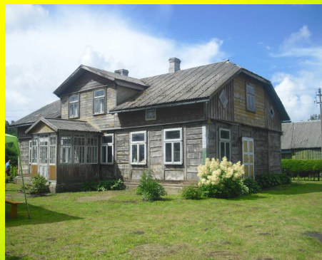
“Laivenieki”, Ziemupe, Vērgale, LV-3462, Latvija Google Maps: http://g.co/maps/k2rm3